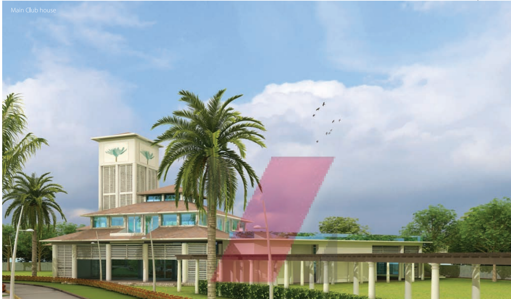
Main Club house