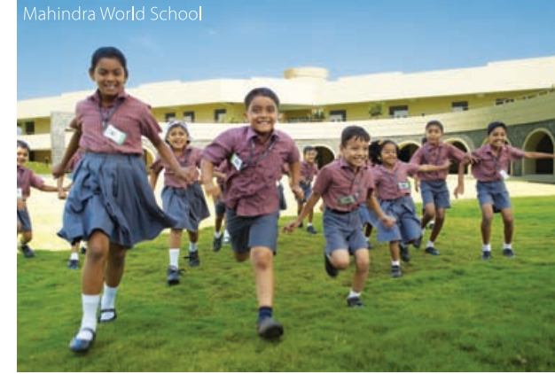
Mahindra World School

in a rapidly developing economic and social environment. Revel in a Work-Live-Learn-Play environment of offices, homes, schools, retail and recreational facilities that will enrich your life.