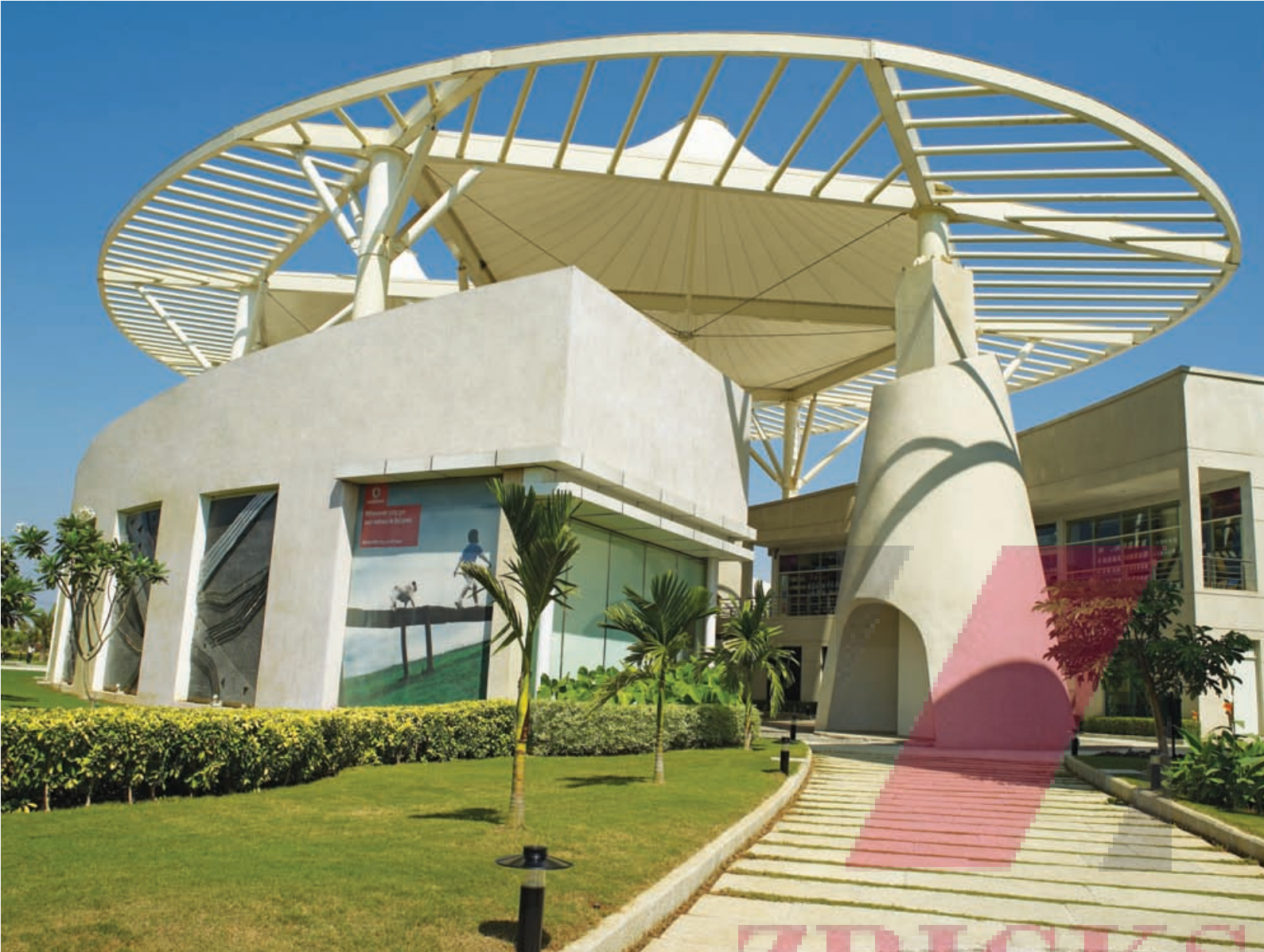
The Canopy - food court and shopping center